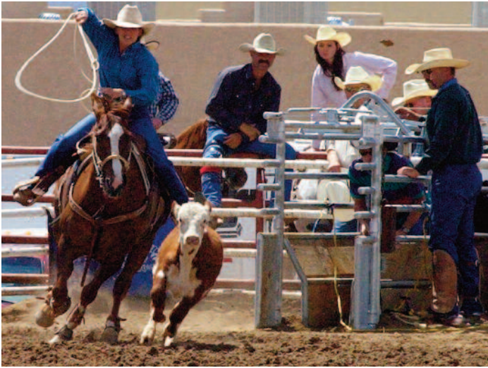
Ranching traditions create an exciting backdrop for program activities.