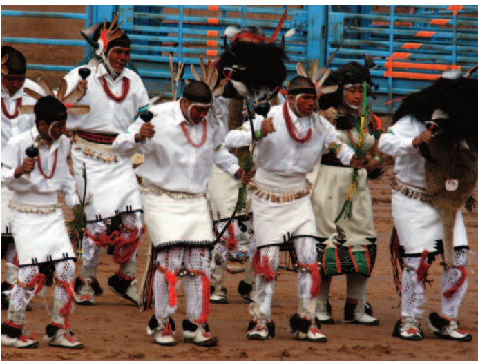
New Mexico’s rich cultural traditions are a laboratory for GLF learning.

GLF will take place on the UWC-USA campus and in Santa Fe, New Mexico, the oldest capital city in the United States. Because of its combination of colorful cowboy traditions, Hollywood movie productions, famous art market, and Indian Pueblo communities, Santa Fe is one of the most visited tourist destinations in the world. The city was designated a “Creative City” by the United Nations Education Scientific and Cultural Organization (UNESCO), the first American city to receive this honor. The city is known for its entrepreneurial and creative small businesses, as well as its variety of high-tech labs and “think tanks.” GLF draws on these resources for a program unlike any other in the world.