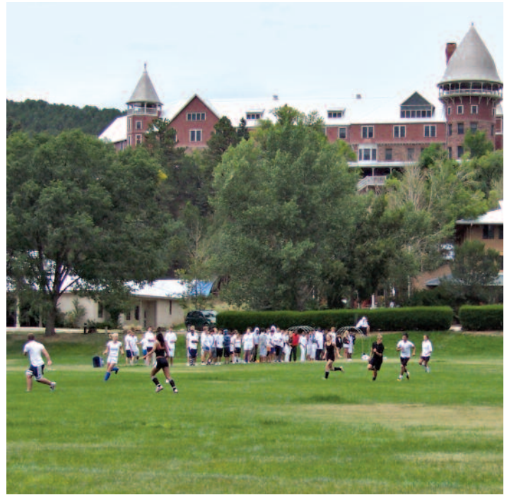
Students from 80 countries live and learn together on UWC's magnificent campus in New Mexico, home of GLF.